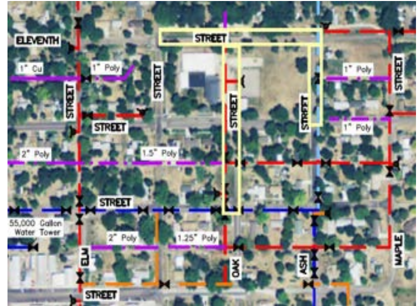
11th, Ash, & Oak Water improvements