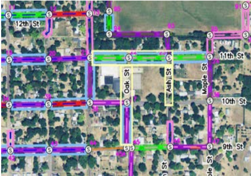
11th, Ash, & Oak Sewer improvements